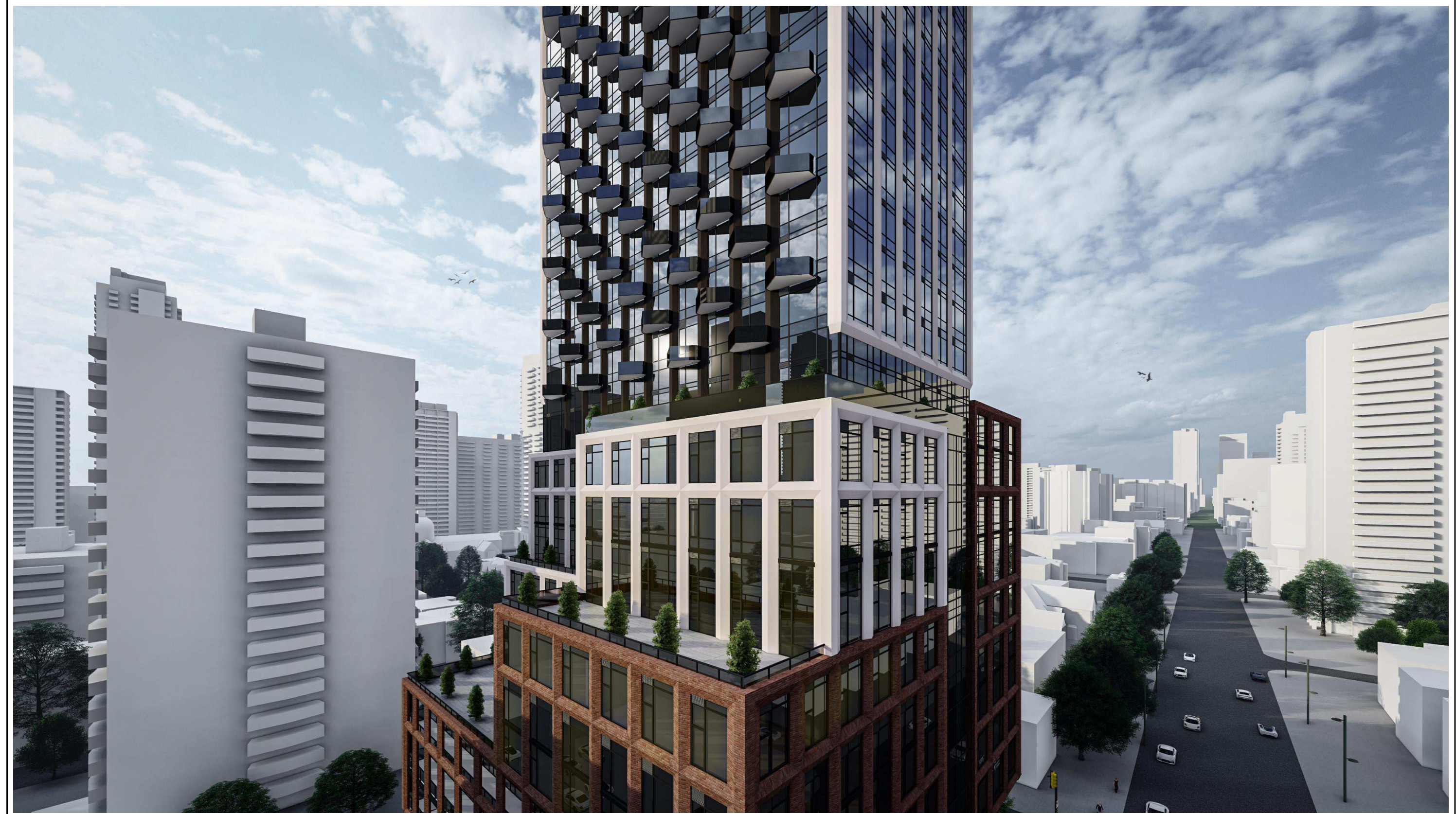
View Name 1 NTS dA6.2

All Drawings, Specifications, and Related Documents are the Copyright of the Architect. The Architect retains all rights to control all uses of these documents for the intended issuance/use as identified below. Reproduction of these Documents, without permission from the Architect, is strictly prohibited. The Authorities Having Jurisdiction are permitted to use, distribute, and reproduce these drawings for the intended issuance as noted and dated below, however the extended permission to the Authorities Having Jurisdiction in no way debases or limits the Copyright of the Architect, or control of use of these documents by the Architect.