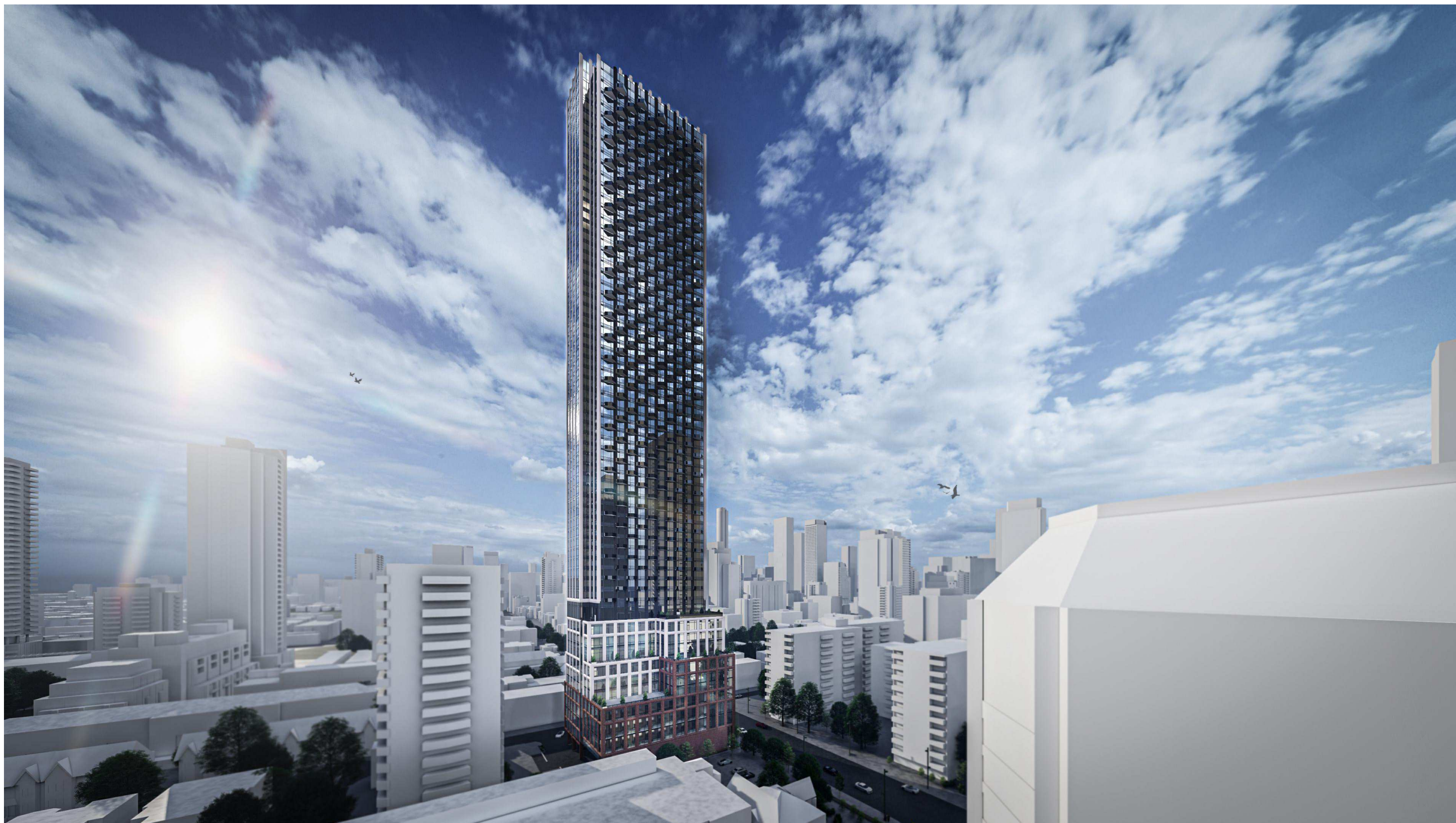
View from Northeast 4 NTS dA6.1