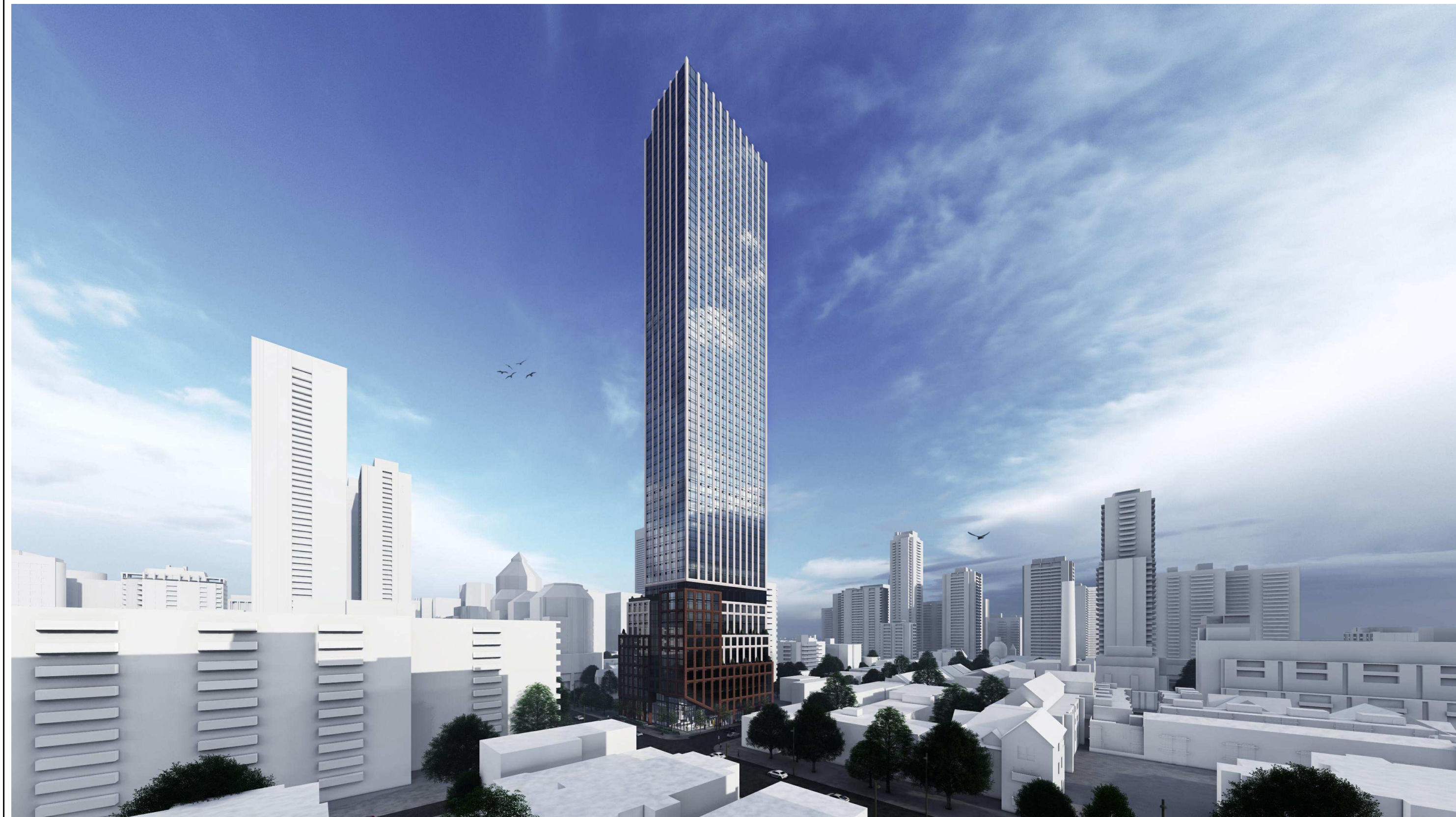
View Name 2 NTS dA6.1