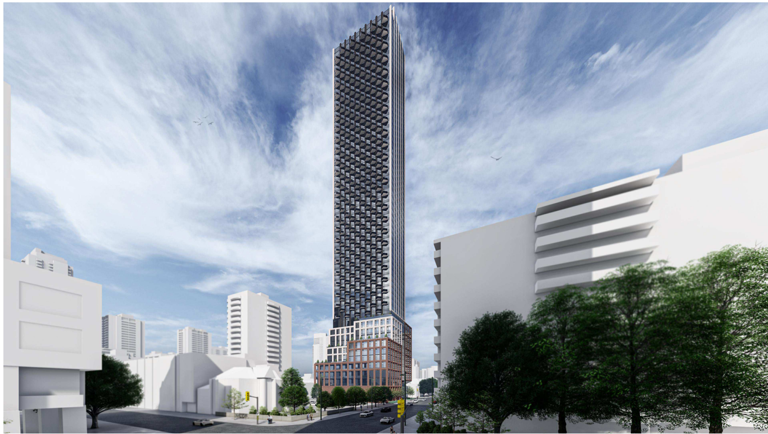
View from Northwest 3 NTS dA6.1