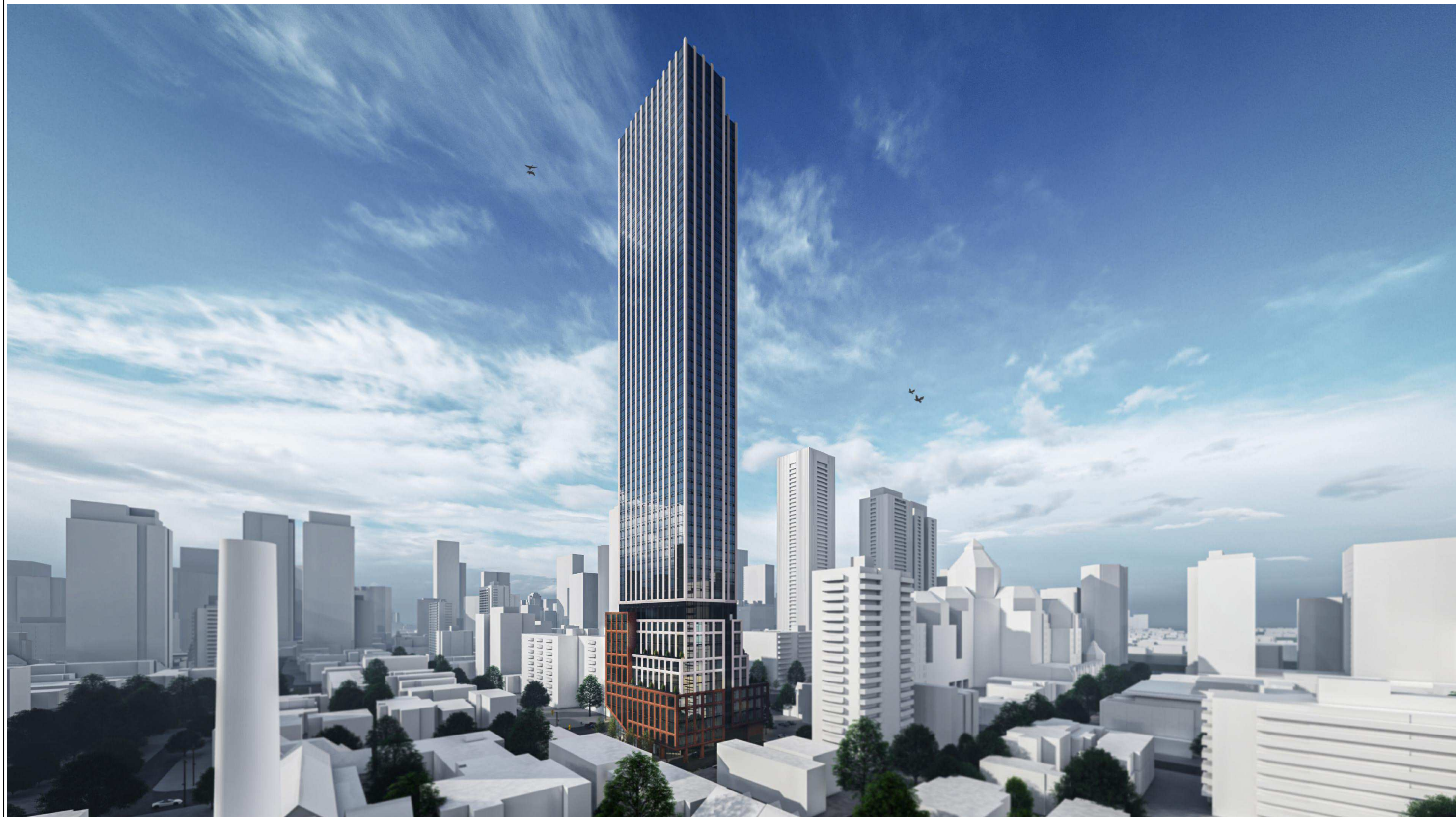
View Name 1 NTS dA6.1