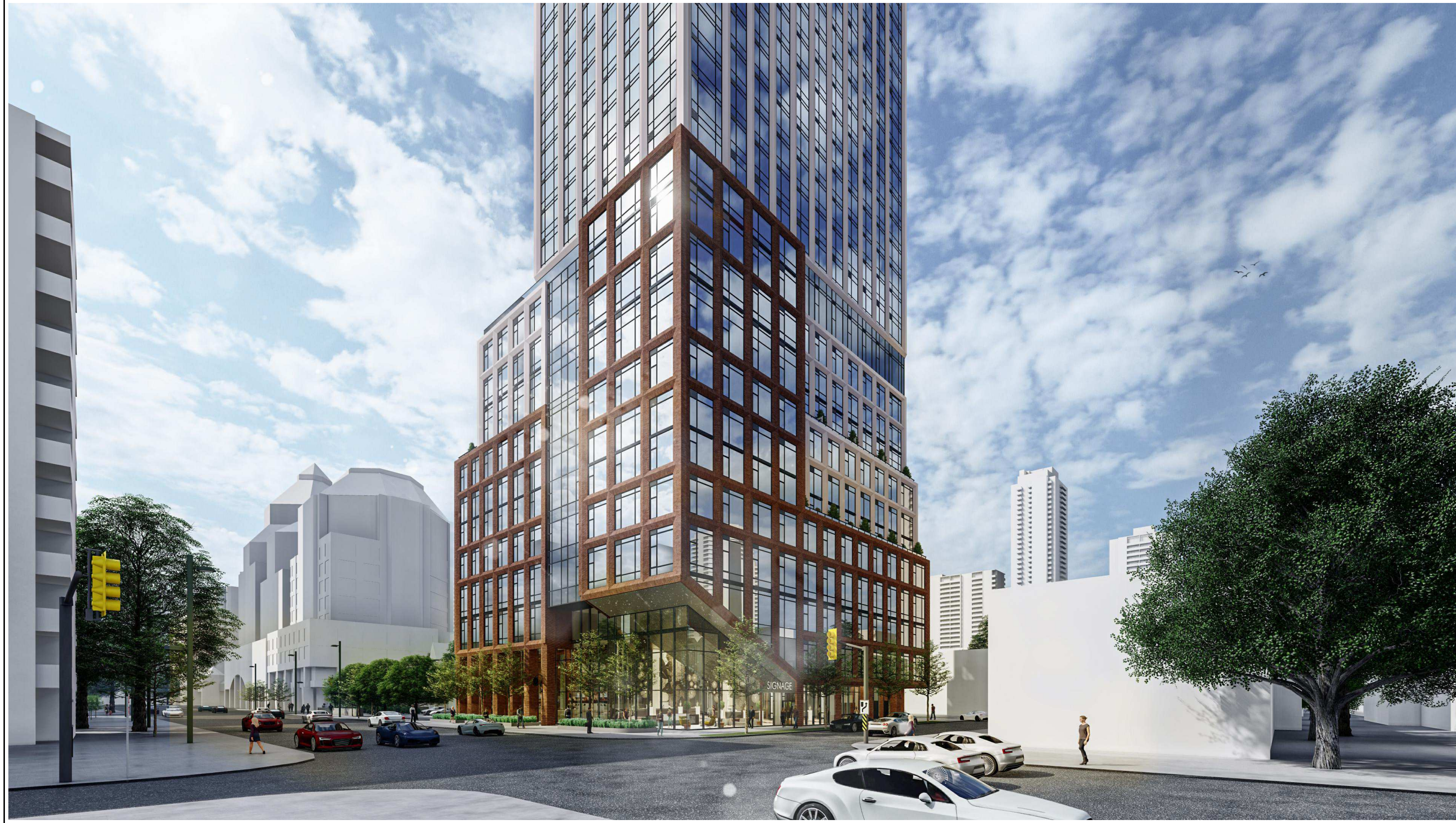
View from Northwest 3 NTS dA6.2