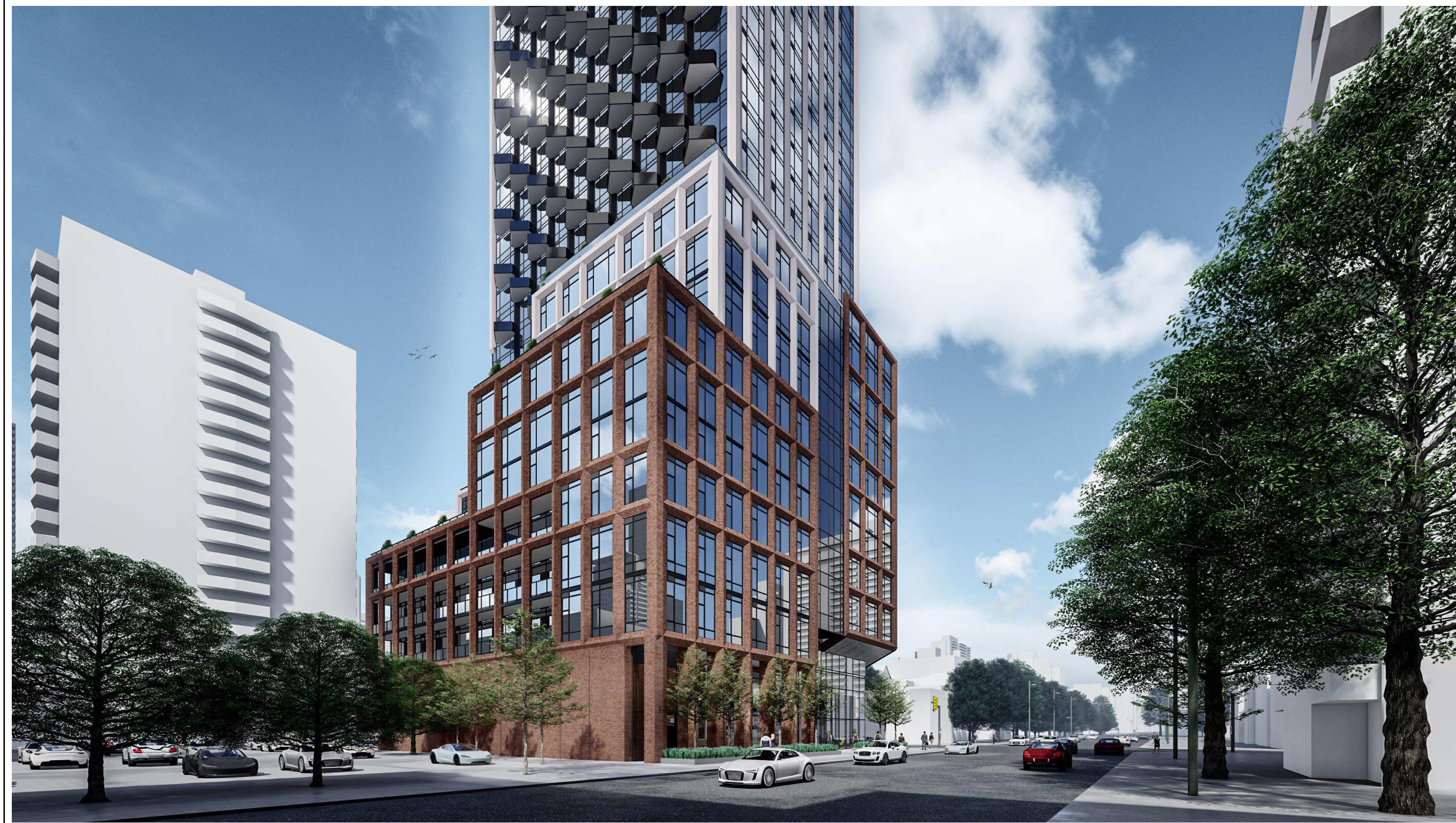
View from Northeast 4 NTS dA6.2