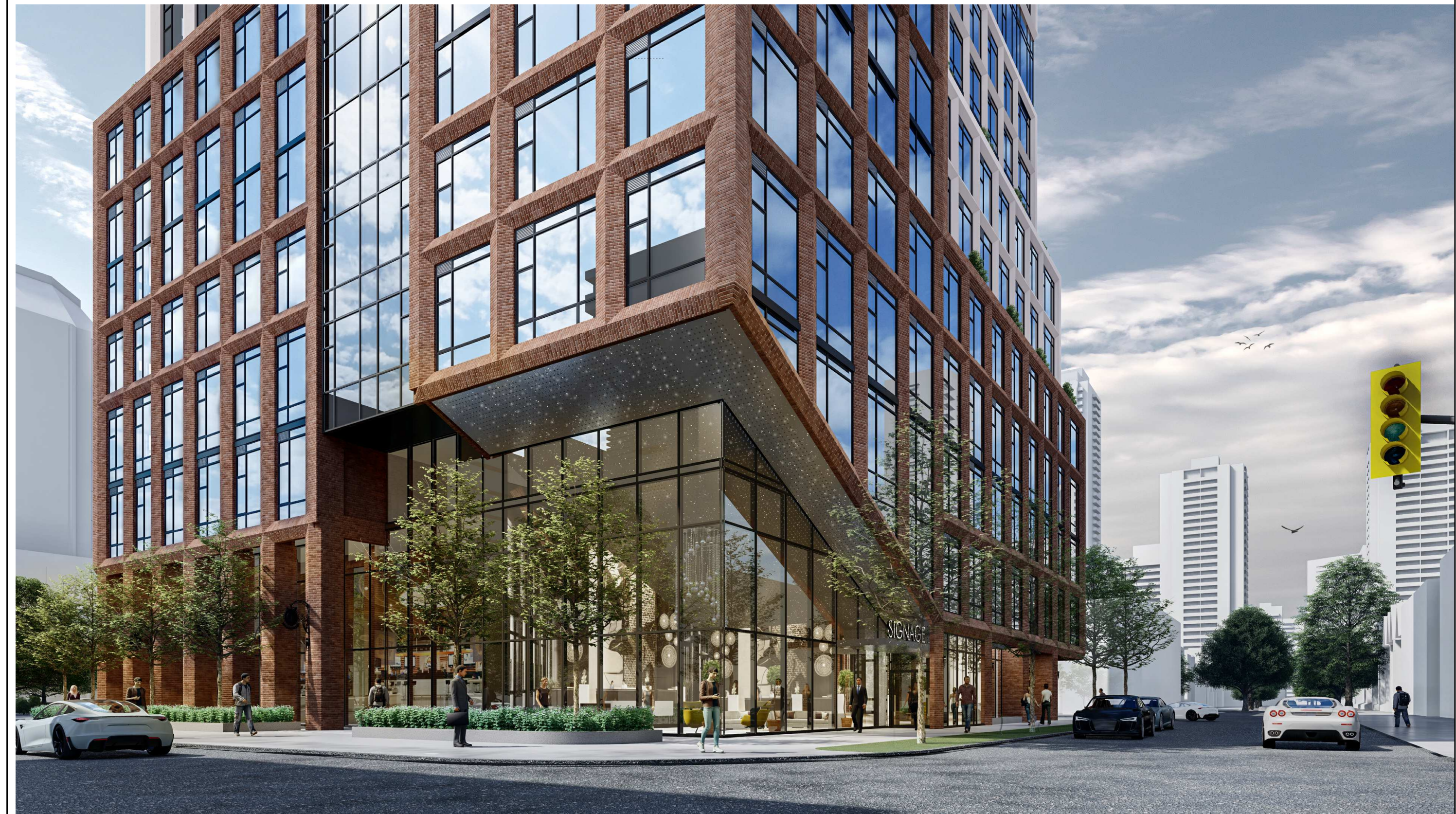
View Name 2 NTS dA6.2